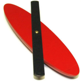
Product of inertia: Negative

Consider a Dynamic Celt with a positive product of inertia. For each initial motion, circle the final spin direction.