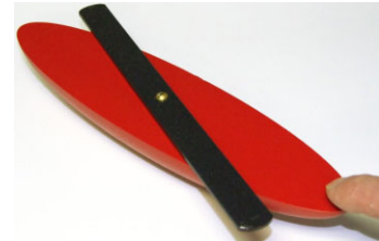
Product of inertia: Negative

Now, adjust the bar so that it has a negative product of inertia. Touch its end so it rocks up and down.