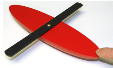
Product of inertia: Zero

To investigate the effect of product of inertia on pitch motions, ensure the Dynamic Celt looks like the one shown to the right ( zero product of inertia) and place it on a flat, hard surface. Touch its end so it rocks up and down.