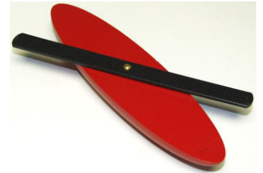
Product of inertia: Positive