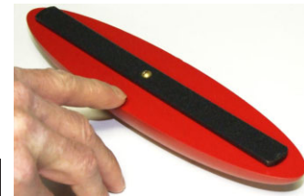
Product of inertia: Zero

To investigate the effect of product of inertia on roll motions, ensure the Dynamic Celt looks like the one shown to the right (zero product of inertia) and place it on a flat, hard surface. Press its side so it strongly rolls from side to side.