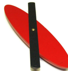
Product of inertia: Negative

Now, adjust the bar so that it has a negative product of inertia (like the figure to the right – with the bar \approx 20^\circ from the Celt's long-axis). Place the Dynamic Celt on a flat, hard surface and spin it so it rotates clockwise . After observing its motion, spin it counter-clockwise .