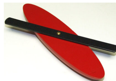
Product of inertia: Positive

Next, adjust the bar so that it has a positive product of inertia (like the figure to the right). Spin the Dynamic Celt so it rotates clockwise . After observing its motion, spin it counter-clockwise .