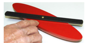
Product of inertia: Positive

Next, adjust the bar so that it has a positive product of inertia. Press its side so it rolls from side to side.