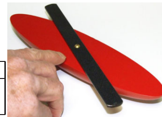
Product of inertia: Negative

Now, adjust the bar so that it has a negative product of inertia. Press its side so it rolls from side to side.