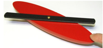
Product of inertia: Positive

Next, adjust the bar so that it has a positive product of inertia. Touch its end so it rocks up and down.